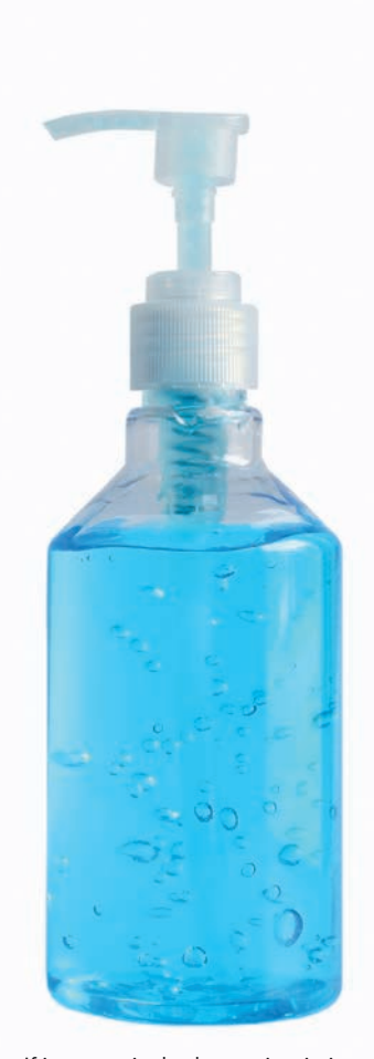
If just one single element is missing from the supply chain, such as the spray cap, a product cannot be delivered.

Now we would like all companies cooperating with China to pay attention to the country's current situation. Although this event is included in the calendar every year, it may disrupt functioning of many European companies. During Chinese New Year all factories in PRC shut